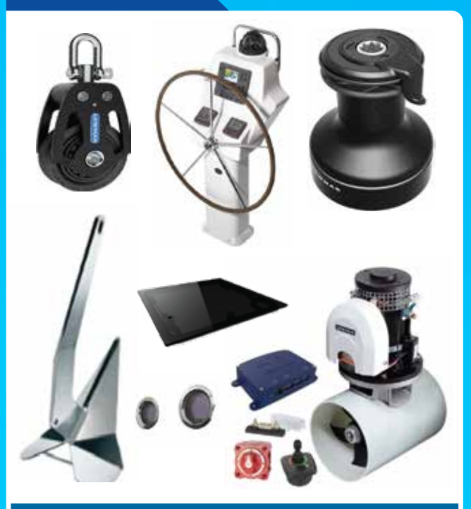
Windlass - Anchor & Anchor chain - Winch -Thruster - Hatch & Portlight - Roof Systems -Glass - Steering - Hardware - Hydraulics