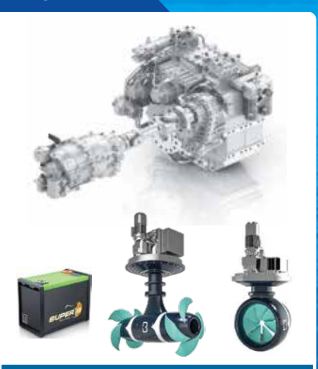
Electric and Hybrid Propulsion - Pod propulsion - Rim Drives - Battery Systems