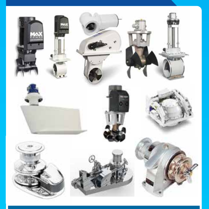
Bow and Stern thruster - Fin Stabilizer -Gyro Stabilizer - Windlass - Capstan - Winch