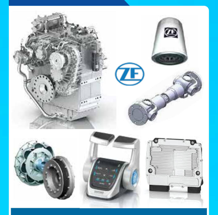
ZF Gearboxes - ZF Filters and Spare Parts -Total Command Control System - Gearbox Couplings - Cardan Shafts