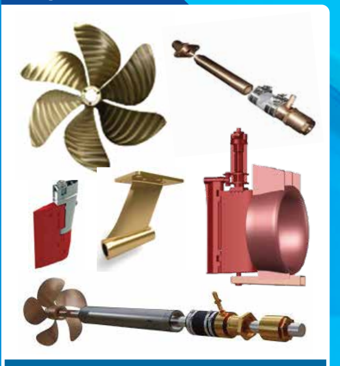
Propellers, ZF Faster Propulsion - Shafts -Brackets and Struts - Rudders - Sterntubes -Kort Nozzles